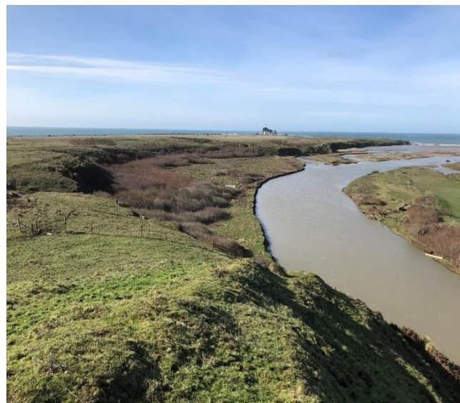
Looking downstream (west) at the Garcia River Estuary Enhancement Project site.