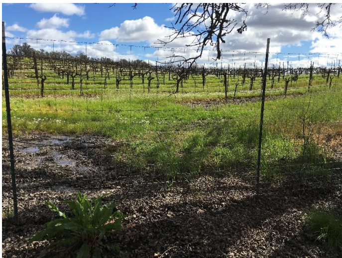
Slusser Road at Laughlin Road Crossing, Santa Rosa, CA.

There are approximately 360,000 acres of productive non-cannabis related agricultural lands in the North Coast Region (Figure 1). These lands are spread throughout the region in distinct geographic and commodity groupings. Agricultural lands have the potential to discharge pollutants to surface water and groundwater through the application of fertilizers and pesticides, human-caused erosion of sediment, and the removal and suppression of riparian vegetation. The North Coast Regional Board's Agricultural Lands Discharge Program includes several commodity-specific or geographic-specific permits to address the highest priority agricultural operations in the region. This update focuses on recent efforts to develop the General WDRs for Vineyard Properties (Vineyard Permit) in the North Coast Region. The Vineyard Permit will address impacts to water quality and meet the requirements of the California Water Code, the State Nonpoint Source Policy, the State Irrigated Lands Regulatory Program, and the Water Quality Control Plan for the North Coast Basin (Basin Plan).